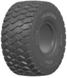
ET5A - E3/L3