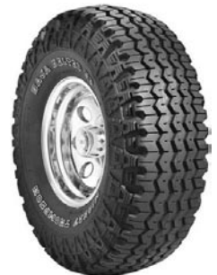
Baja Belted HP