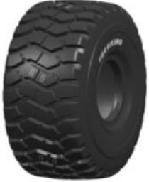
ET6A - E3/L3