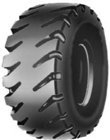
ETMINEA - L5