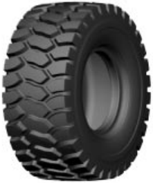
ETDT - E4